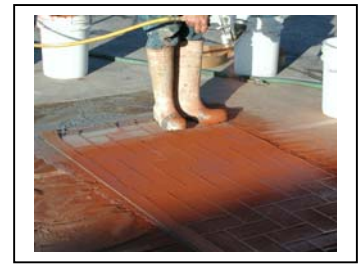
SPRAY TEXTURES SPRAY STENCILING