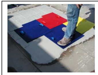
STAMPED CONCRETE STAMPED OVERLAYS