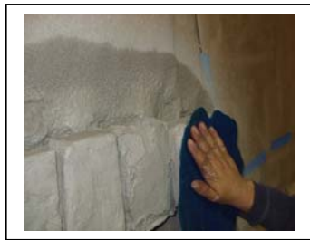
VERTICAL STAMPING WALL CARVING