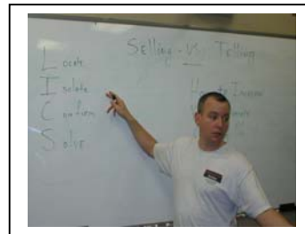
SALES & MARKETING ESTIMATING & PRICING