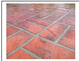
STENCILED CONCRETE COLOR ANTIQUING