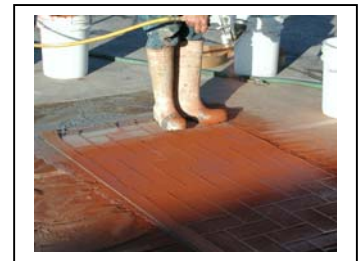
SPRAY TEXTURES SPRAY STENCILING